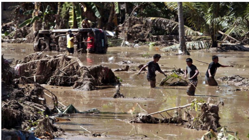
Aftermath of Typhoon Sendong