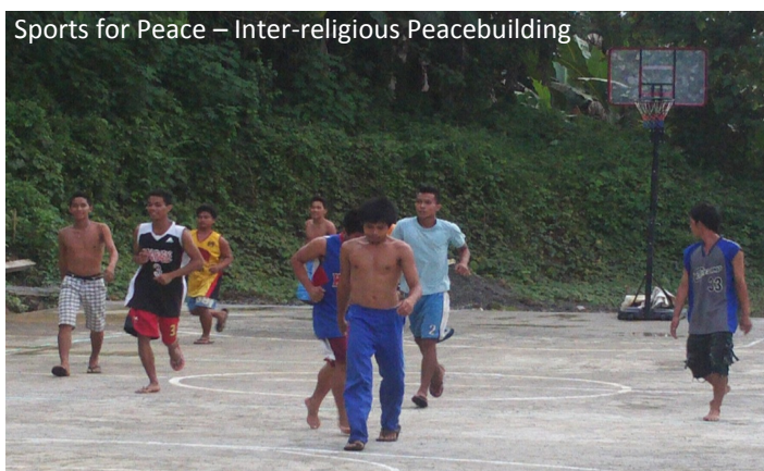
Sports for Peace – Inter-religious Peacebuilding