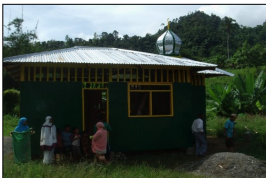
The construction of a mosque

The next community to be assisted were in the village of Kabangahan-uno and later, the people of Caluda and sil-ica villages received temporary shelters. With the help of friends and companies, we were able to build almost 250 temporary shelters for about 200 families. Muslim families were the first to be given houses because they were the most affected. We built wooden houses for them and assisted them with food. At this critical point, a cup of rice is precious for any family.